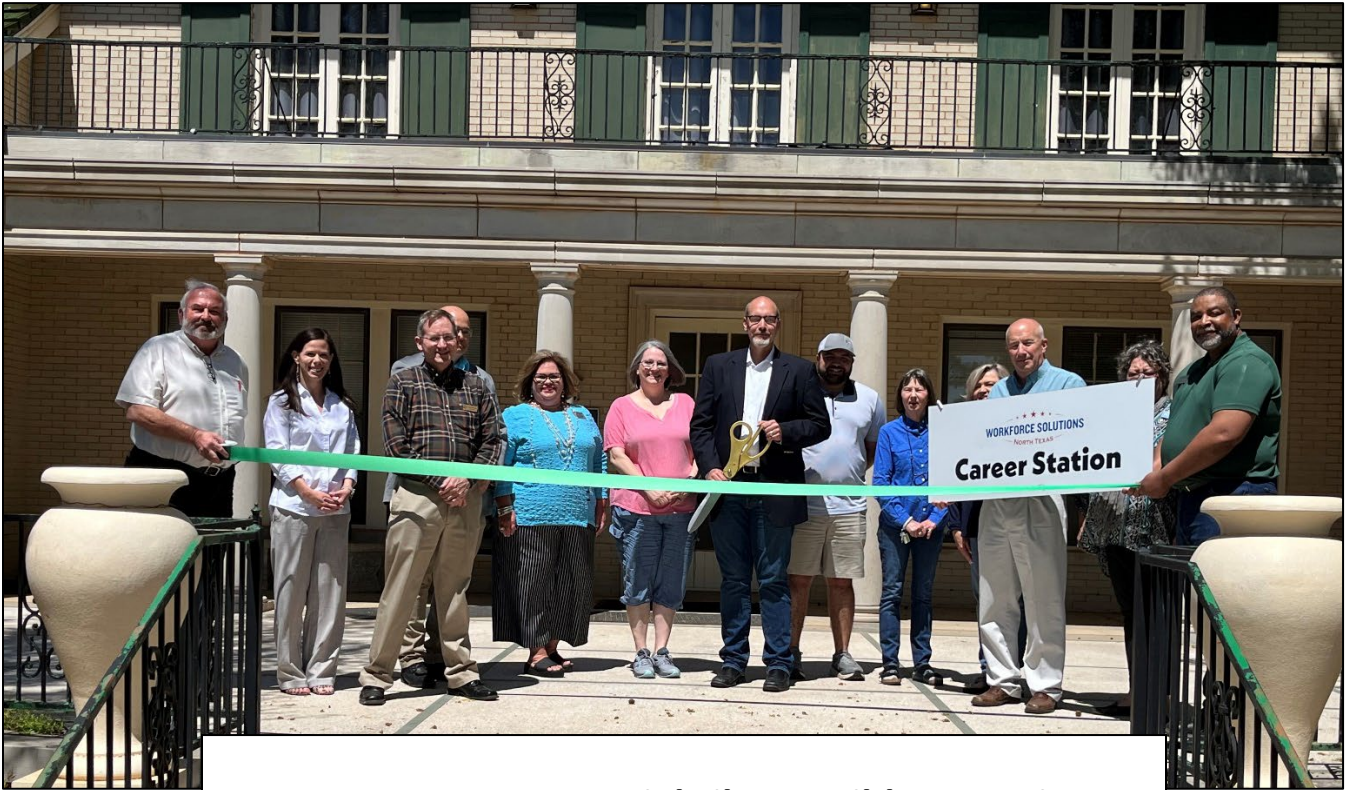
Tom Burnett Memorial Library Ribbon Cutting Wednesday, April 12, 2023, in Iowa Park, TX