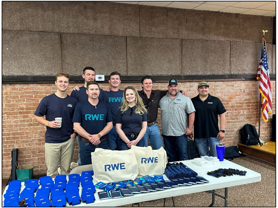
Regional Job Fair (Crowell Wind Farm)