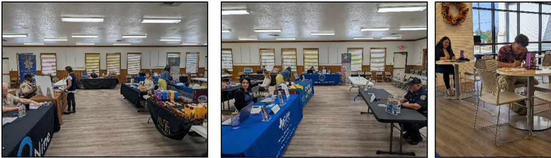
Jack County Job Fair-October 23rd